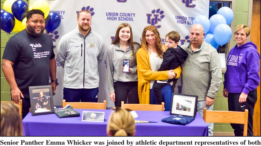
Union County High School and Truett McConnell University during her signing ceremony

single-season assists record, dishing out 347 during her junior campaign of 2020.