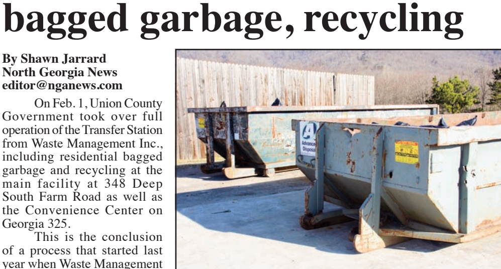
The Union County Transfer Station will soon be returning to using more environmentally friendly front-loading dumpsters in place of these roll-off dumpsters that appeared on the